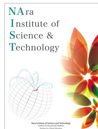
<Flyer of Division for Global Education>

As part of globalizing efforts in graduate education, syllabi for courses offered in all three graduate programs became available in English. To prepare for a transition to a unified graduate program in the next few years, as well as an addition of international program for advanced science and technology (5-year doctoral program) to the curricula, English will become a primary medium of communication and instruction.