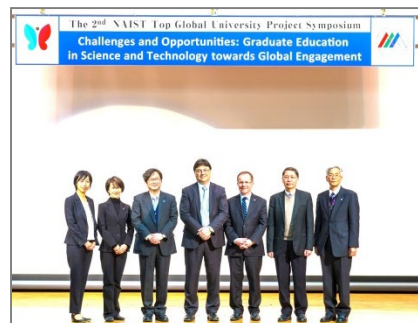
〈Symposium Organizing Committee with Keynote Speakers〉

In addition to existing double-degree programs with Oulu University (Finland) and Paul Sabatier University (France), NAIST added programs with National Chiao Tung University (Taiwan), Unitec (New Zealand), and University of Malaya (Malaysia). The programs will further educational opportunities for both inbound and outbound students.