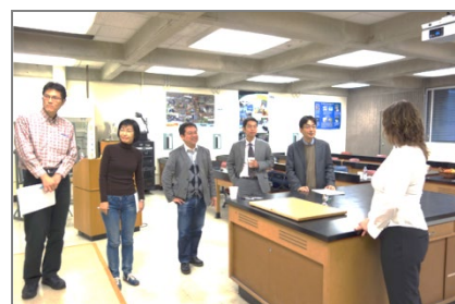
〈Faculty Development Program〉