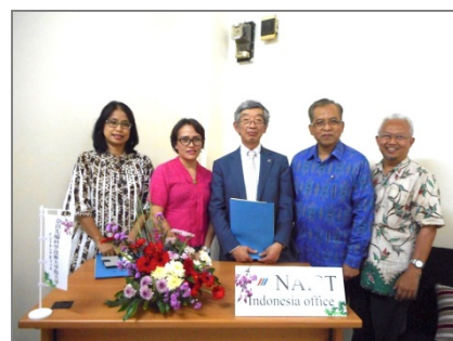
〈Opening of Indonesia Office〉

NAIST opened its first Overseas Education Collaborative Office in Bogor, Indonesia. As an Asian hub, the office will strengthen NAIST's international presence with objectives of improving recruitment and selection of international students, furthering relations with partner institutions and corporations, and promoting collaborative education and research with NAIST alumni in Indonesia and surrounding areas.