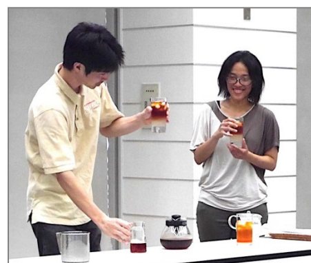
<NAIST Tea Time>

Each year, NAIST delegations actively visit international partner education and research institutions, governmental offices, "Study in Japan" fairs, and others. English materials including guidebooks are critical in introducing our educational and international activities. Division for Global Education is now furnished with a flyer to explain NAIST's approach to the Top Global University Project. NAIST widely distributes these materials to improve its presence in the international educational and research community.