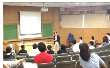
<NAIST Introduction at Partner Universities>

The Overseas Faculty Development Program was held at the University of California, Davis. Seminars in university teaching and learning, followed by laboratory visits, are learning opportunities for NAIST faculty members to prepare for top-level graduate education in science and technology.