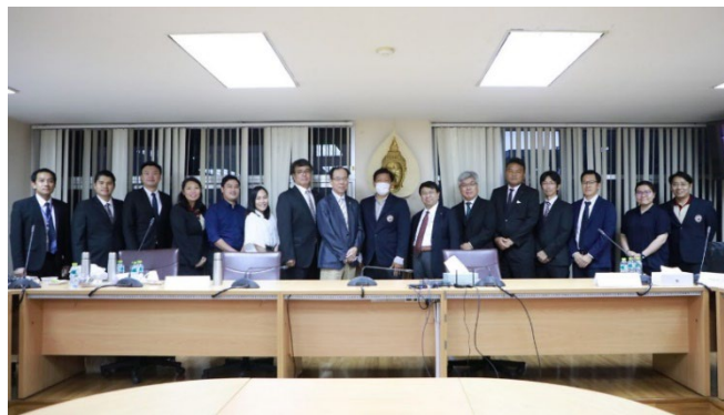
〈Symposium at NAIST Thailand Office〉

NAIST is actively recruiting students through its overseas offices in Indonesia and Thailand, which were established as hubs for education/research collaboration in Asia. After travel restrictions due to Covid-19 were relaxed, NAIST held the “NAIST and Thai Universities for Research and Education Collaboration Symposium 2022” on September 6, 2022 to commemorate the 5th anniversary of the NAIST Thailand Office at the Faculty of Engineering, Kasetsart University, where the office is located.