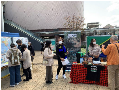
〈Booth presentation at the Friendship Festa〉