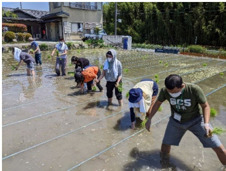
〈Students and citizens planting rice〉

As a part of collaboration with Ikoma City, with which NAIST concluded a comprehensive collaboration agreement in 2021, a rice planting and matcha tea event was held on June 4, 2022 in Takayama area where NAIST is located. International students and local citizens joined the event and interacted with each other. In addition, NAIST and Ikoma City co-hosted the "Ikoma International Friendship Festa" near Ikoma Station on October 30, 2022, where Tanzanian students exhibited a booth to introduce their country and Indonesian students performed traditional musical instruments. NAIST also held events with Ikoma City Library twice (2022.11.12 and 2023.2.12) where Malaysian students and a Jamaican student interacted with citizens by reading picture books to children, introducing their cultures and playing games. Through these activities, NAIST was able to not only increase its presence in the local community, but also to help our international students understand Japanese culture and promote multicultural understanding among local residents.