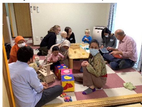
〈Gathering at on-campus nursery room〉

The Center for International Students and Scholars (CISS) provides daily life support (city hall procedures, medical arrangements, childcare procedures, etc.) for students, researchers and their family members. In addition, CISS held gatherings at the on-campus nursery room three times (2022.10.27, 2022.12.22 and 2023.3.24) to promote interaction among family members of international students/researchers. CISS also promote cross-cultural exchange between international students and Japanese students through on-campus events such as a calligraphy event (2023.1.6) and the International Performance Stage (2023.2.28)