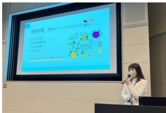
〈SD training program debriefing session〉

With the aim of developing highly skilled staff who can respond to the needs of global campus, NAIST sent one administration staff member to Hawaii Tokai International College for two weeks for an overseas staff development (SD) program. Through the program, the participant conducted research related to student support through lecture-based training and interviews with local staff. The training results were shared with other staff at a debriefing session held on February 17, 2023. In addition to this, nine staff members participated in the on-campus English training program where they focused on occupational written and spoken English. As a result of these ongoing efforts, the percentage of administrative staff with a TOEIC score of 750 or higher reached 31% (53 in total).